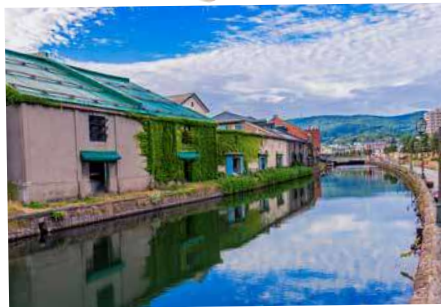
小樽运河 Otaru Canal