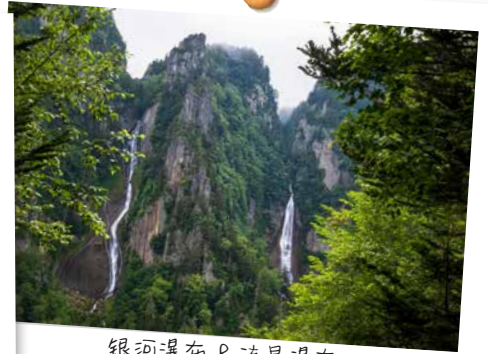
银河瀑布 & 流星瀑布 Ginga & Ryusei Waterfalls