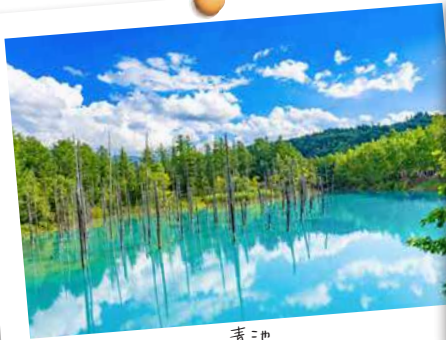
青池 Blue Pond