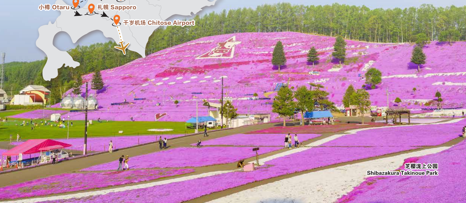
芝櫻滝上公園 Shibazakura Takinoue Park